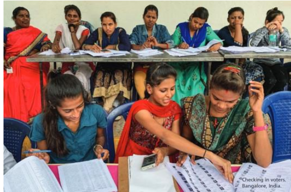
Outcomes B2 3 rd edition, unit 4

Laura Hudson National Geographic Learning laura.hudson@cengage.com